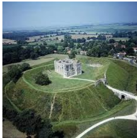
Castle Rising Castle