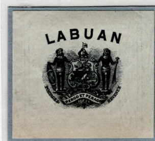
Labuan die proof of the 24c vignette 'LABUAN' added