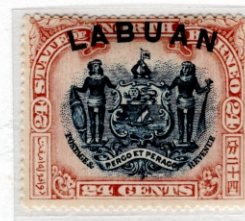
Labuan 24c value

At least that was meant to happen and did so for the 1894 issue, but in the 1897 issue with redesigned frames three of the stamps ended up being visibly inscribed both 'LABUAN' and 'NORTH BORNEO' – but that's another story!