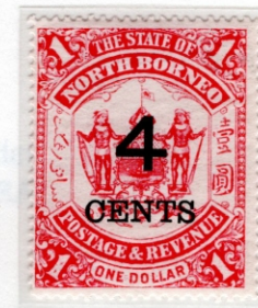
1895 4 cents on $1

The issued '4 CENTS' provisionals were a composite of '4' from row 2 and the 'CENTS' from row 5