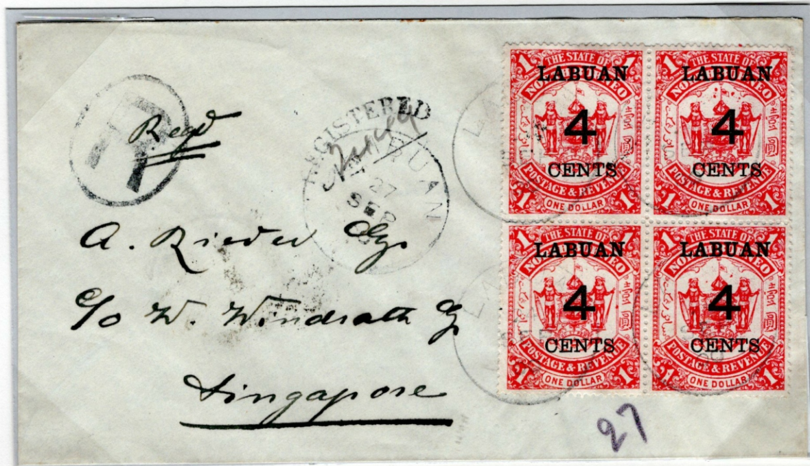
Photocopy of Proud D7

'27 SEP 00' Registered cover to Singapore franked with four copies of the 4c provisional to pay for a double weight (1oz) letter (4c per 1/2 oz) + registration (8c) Registration cachets: Proud R2 (oval 'REGISTERED') and Proud R8 ('R' in oval)