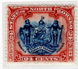
North Borneo 24c value

The 24c values of North Borneo and Labuan and the Labuan die proof of the 24c vignette plate below illustrate this.