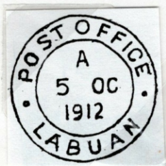
Photocopy of genuine c.d.s.

Forged Postmark: Dated '28 JUL 1910' a Double ring inscribed 'POST OFFICE / LABUAN'. Similar to Proud D11 but with larger lettering. Would have been very late usage of the provisional as Labuan was administered by the Straits Settlements from 1906 and used their stamps. (Ref: Proud Pg 279)